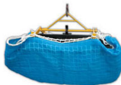
• Protection net